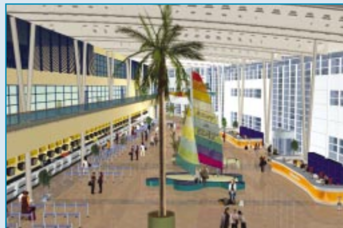
Artist impression of the check-in hall in the new terminal building.