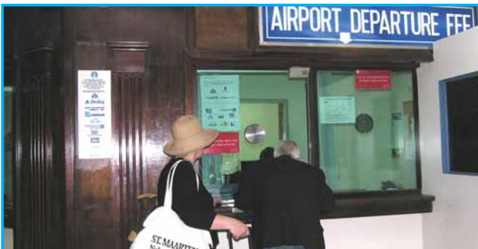
The Airport Departure Fee (ADF) counter

And, just like the departure fee (of US$ 10 for domestic and US$ 30 for international flights), the transfer fee will be included in passengers' ticket price. "Passengers will be paying this fee when they purchase their tickets and the airlines would subsequently pass the payment on to the airport. Therefore most passengers will not have to go and stand in line in front on the counter to pay the fee. It will become part of the system we have for collecting our departure